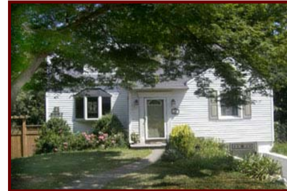
38 Francis Lane

Enter this light-filled home with terrific style and fun colors, and you will immediately smile. Built in 1941, with all the charm and quality of that period-masonry fireplace, pretty floors and moldings. Now updated, this 3 bedroom, 2 bath Cape Cod home is perfect for today's lifestyle. Most especially you will love the open eat-in kitchen and wonderful sunny family room with cathedral ceiling, skylight and lots of windows. From the family room, a door opens to a spacious deck, perfect for summer dining. On the first floor there is a bedroom, bath and a den, ideal for an office or single bedroom. Upstairs, there is a master bedroom with ample closets, a double bedroom and an updated bath. The lower level playroom opens to the patio and a level private backyard and to the garage. Rarely does a home that offers so much come on the market at such a reasonable price! Move in and enjoy! $739,000