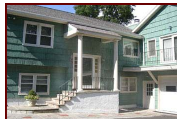
241 Pemberwick Road

Are you looking for a spacious home—one filled with possibilities? You will be delighted with this very special, uniquely designed home with seven bedrooms and two family rooms. With ample rooms, you may discover this is the home where you can have your own home office, a craft room, an exercise room or perhaps just a room for meditation. It is also great for grown children, returning home, in-laws and guests. Ideally located, this home is on a private, pretty .33 acre site and is set back safely away from the road. A long, new, driveway leads you to this home surrounded by flower filled rock gardens and grassy areas. In Summer and Fall, dining on one of the two decks is especially fun and relaxing. Amenities include a fireplace, hardwood floors, vaulted ceilings, plus more. Updated in 2001, this home has the convenience of being close to schools, shopping and transportation. $1,065,000