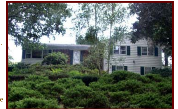
15 Watch Hill Drive

Located on a tucked-away Glenville cul-de-sac, this 1969 ranch with 1702 square feet has been owned and enjoyed and immaculately cared for by the same family for 35+ years. The wonderful high site makes you feel on top of the world! The room arrangement is just right for easy living and entertaining. All rooms-including the living room with fireplace, the formal dining room, and the eat-in kitchen are both spacious and bright. Extra pluses include central air, a 2 car garage, and a basement. The lovely patio looks out to the private rear yard and has seasonal views of the Sound. There is tremendous expansion possibility-the lot is .41 acre in the R-20 zone. This fine home is surrounded by many properties of much greater value - making it a wise choice for investment-conscious buyers. $925,000