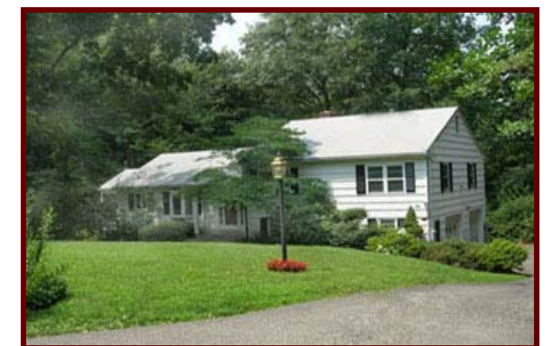
89 Bowman Drive

This is the moment to capture your dream of living in the very special Greenwich neighborhood of King Merritt - a popular, rapidly growing in value neighborhood where residents enjoy their quiet streets and community spirit. This spacious, 4 bedroom home will immediately feel like your own private retreat. Lay your cares aside and relax on the screened in porch with lovely views of the stream and surrounding woodlands. Have fun with barbecues and picnics on the rear terrace. On the garden level, you will discover a wonderful suite of rooms- a playroom, office, bedroom and a bath with a whirlpool tub. Enjoy as is or update, knowing you will have happy living and an excellent financial investment. $1,365,000