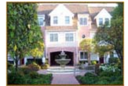
Old Greenwich Gables