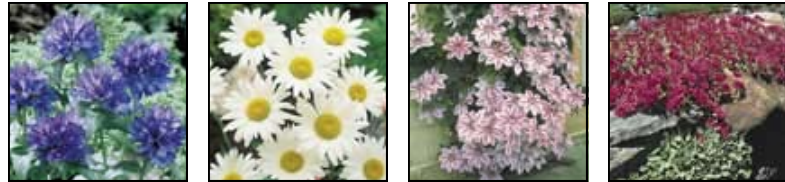
A B C D

Learn more by visiting: BackyardGardener.com