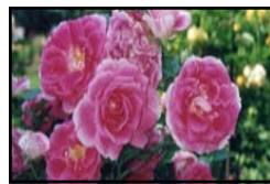
Carefree Delight Modern Shrub Rose