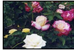
Double Delight Pascalielina